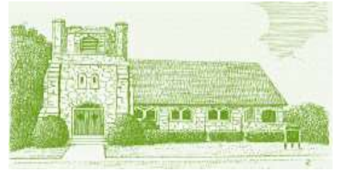
"The Little Stone Church That Rocks"

Brookfield Unitarian Universalist Church 9 Upper River Street, P.O. Box 386, Brookfield, MA 01506 buuc01506@gmail.com , www.buuc.org , 508-867-5145